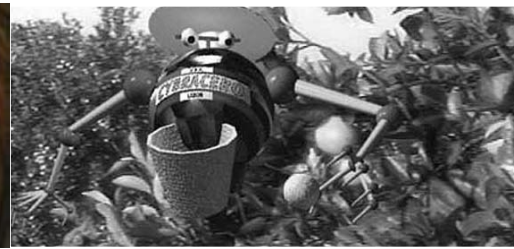
Los Cartoneros, Land, Rain & Fire