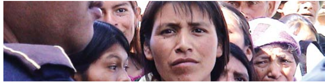
Sipakapa Is Not For Sale

Get a 15% discount on all new Latin American and Latino/a titles when you mention promo code EBLA2008.