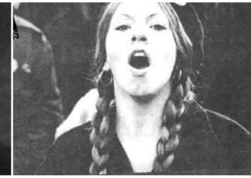
Ritual Rhythms, Cuban Roots, E Mihna Cara