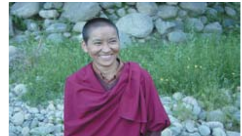
Sisters of Ladakh

An inquiry into the feminine vision of Buddhism. Filmed on location in Ladakh, on the Himalayan border between India and Tibet, it features stunning photography with testimonies of Tibetan nuns. DVD Rental: $75/DVD Sale: $225