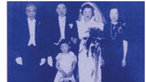
Spirit of the Dragon