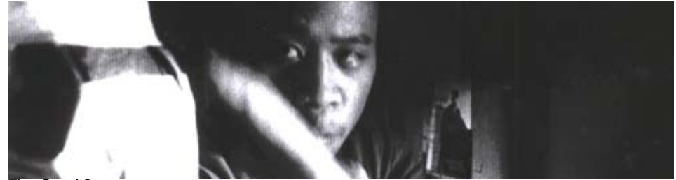
The Good Son

Ming-Yuen S. Ma 1993, 21 min The first in a series addressing Asian/Pacific Islander Gay experiences, this multilevel narrative explores sexuality, identity and tradition. Video Rental: $50/Video Sale: $175